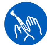
Inspection and maintenance